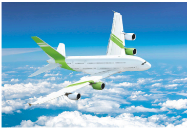
Aerospace & Defense